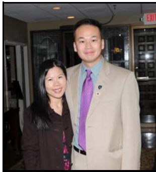
Picture taken at AALEA 25th Anniversary Dinner, October 9, 2008